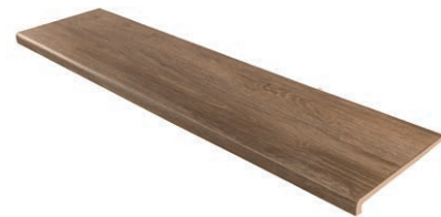
Peldaño Extrusionado 32x120