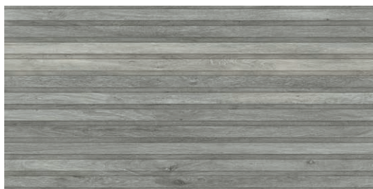
At. Rlv. Viggo Ceniza

GRES PORCELÁNICO (TIERRA COLOREADA) PORCELAIN TILES (COLOURED BODY) - GRÉS CERAMÉ (MASSE COLORÉE)