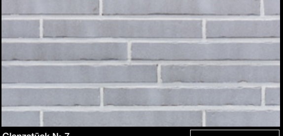
long format 440 x 52 x 14 mm