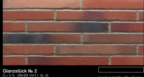
long format 440 x 52 x 14 mm