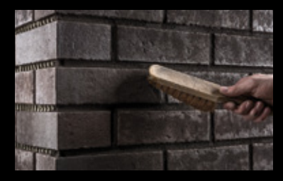
Sweeping out the joint gives it a corresponding structure.